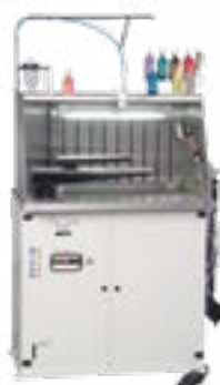
FSU4 Pre-Spotting and Pre-Brushing Cabinet with vacuum