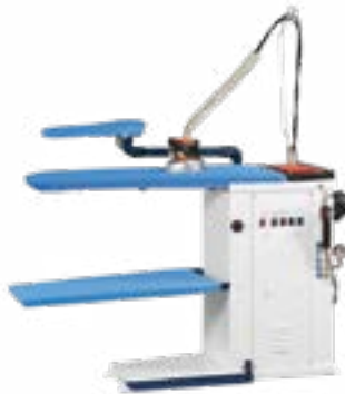
FIT2B Vacuum Ironing Table with integrated automatic boiler