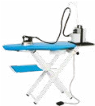
FIT1 Folding Table with manual boiler (2 hours) + iron