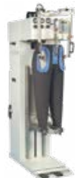
FTT2 Trousers Topper