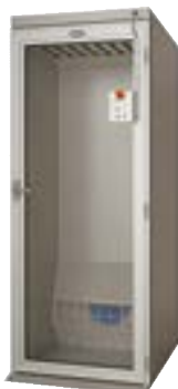
FC48 Finishing Cabinet 8 hangers