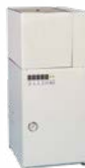
FSB24C Boiler 24 kW with condensate collecting tank