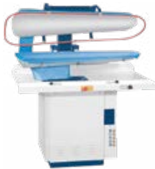
FPA1-WC Automatic Laundry Press with universal shape