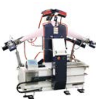
FSF3 Pressing Shirt Finisher