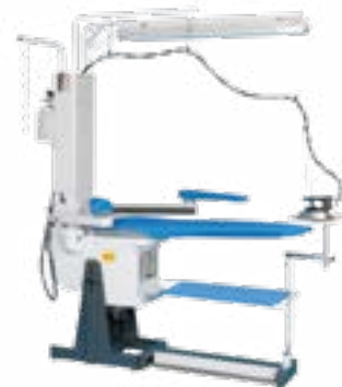
FIT1-WC Vacuum/Blowing Table (left ended) without boiler