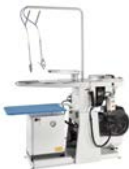
FSU7 Pre-Spotting Portable Table