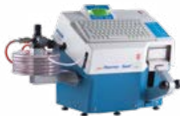
Y150 Marking Machine

This is a selection of the key finishing products. A wide range of options and accessories (trolleys, bases, condensing units, etc) is also available. Ask your local office!