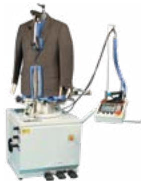
FFT-WC Jacket Multiform Finisher