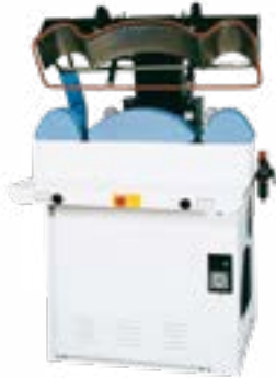
FPA6-WC Collar and Cuff Press