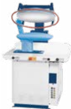
FPA3-WC Automatic Laundry Mushroom Press