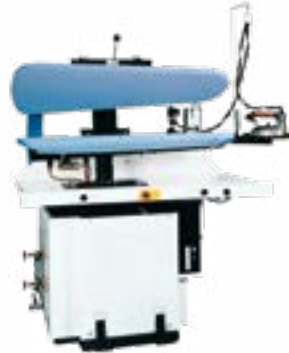
FPA1-D Automatic Cleaning Press with universal shape